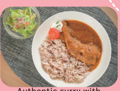
Authentic curry with various spices using homemade curry roux.