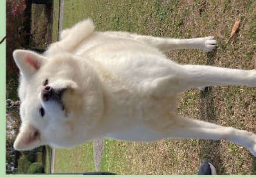
Akitainu fureaidokoro in Senshu Park