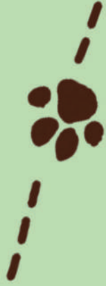
Theater Café C's