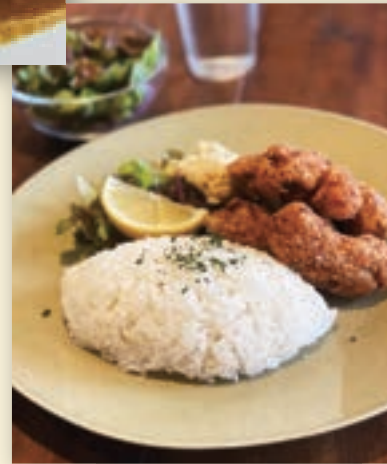
Fried Soybean Meat (Vegan Friendly)