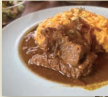
Omelette rice with demi-glace sauce and spare rib curry