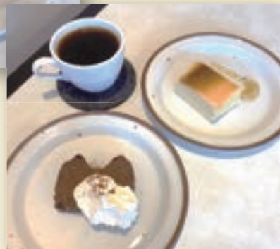
Coffee (Tanzania) Chocolate Terrine Cheesecake