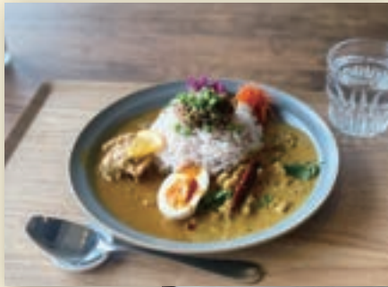
Three kinds of curry plate