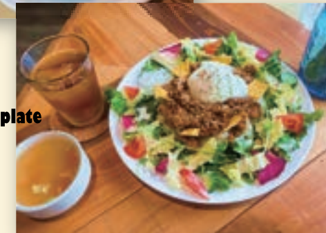
Taco and rice plate