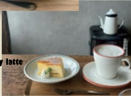
Kase Kuchen Komatsu's honey latte