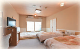
▲Japanese and Western Room