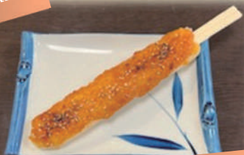
Miso-tanpo Miso Rice Stick