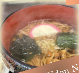
Inaniwa Udon Noodles