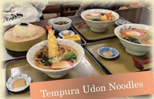
Tempura Udon Noodles